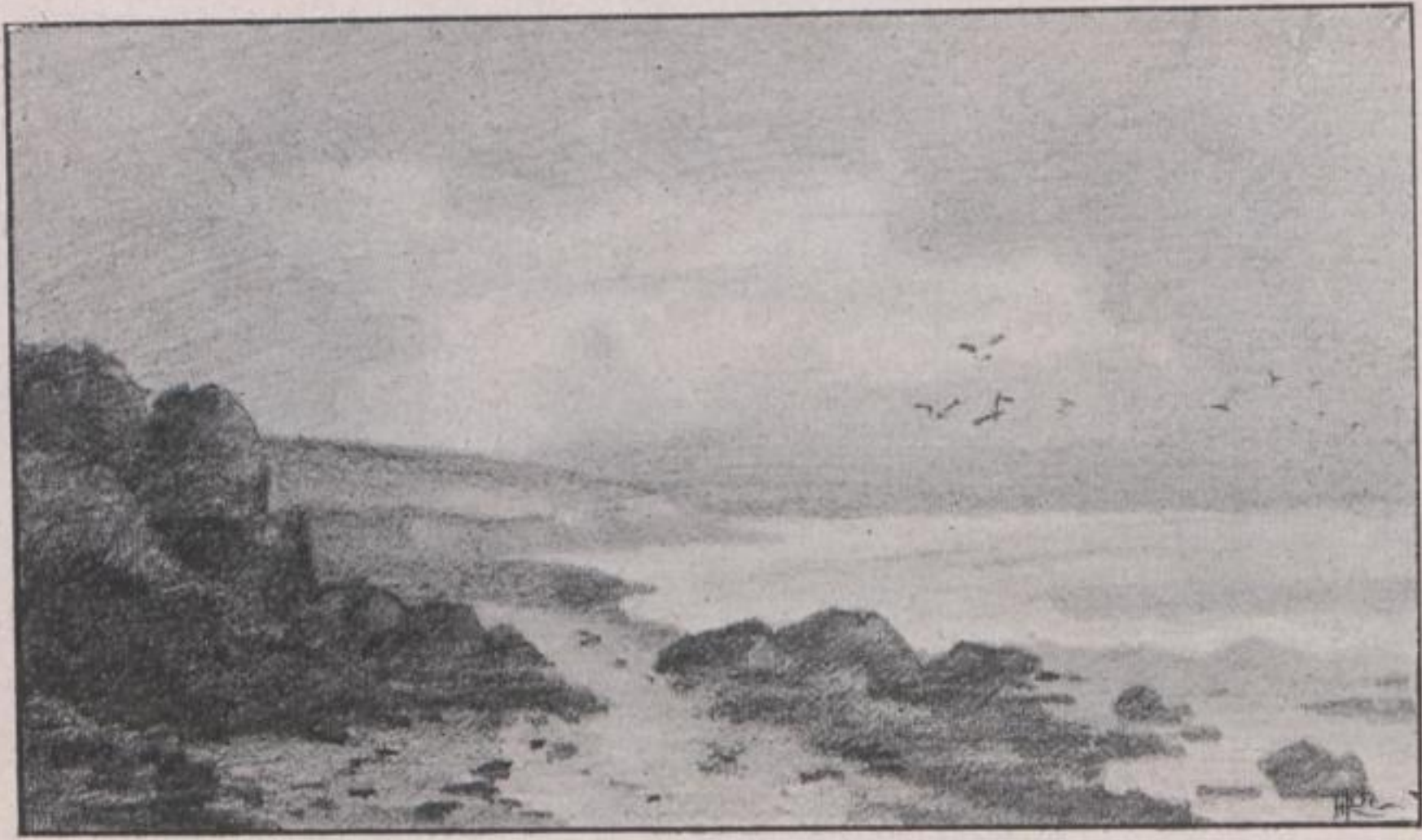
EYMIEU (B.-L.). Avant l'Orage. — Before the storm.