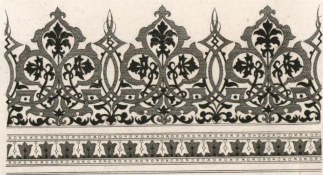
Grundverzierung und Bordüre.