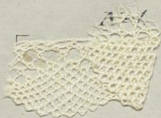
N o 2.