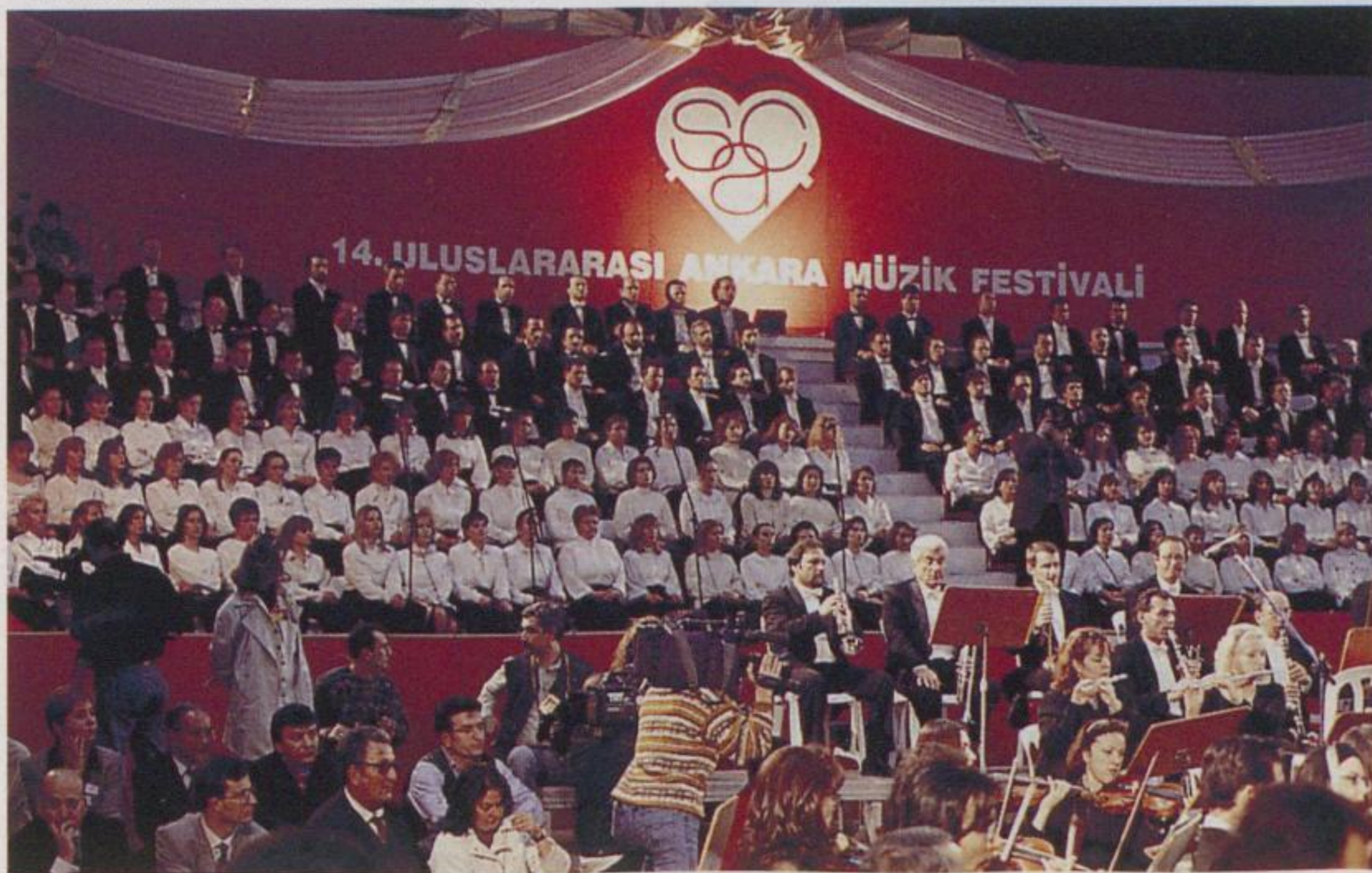
14th International Ankara Music Festival's Opening Concert - The Ankara Orchestras and Choirs - Akyurt/Ankara/Convention Hall (30th March 1997)