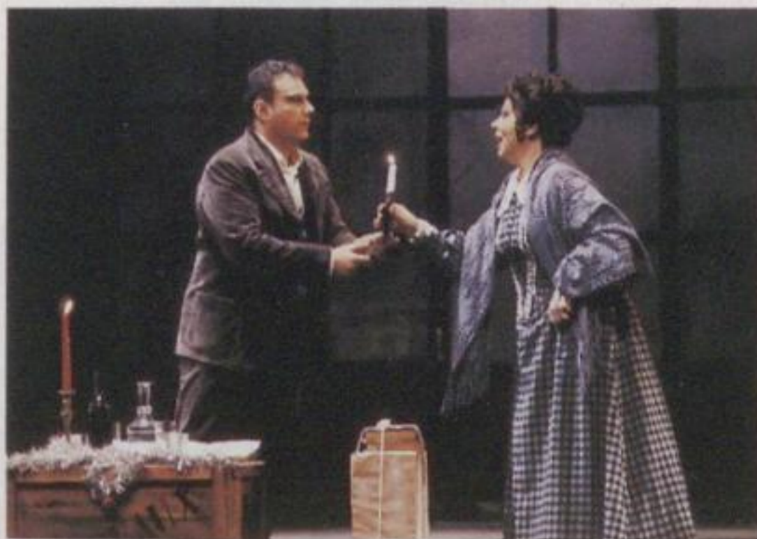
La Bohème 1997 (Mirella Freni and Vincenzo La Scala)