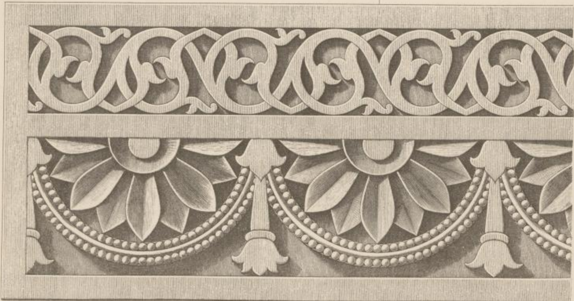
FIG. 2. FROM THE QUTB, NEAR DELHI.