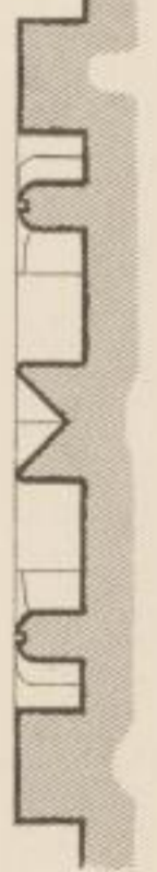
SECTION ON C D.