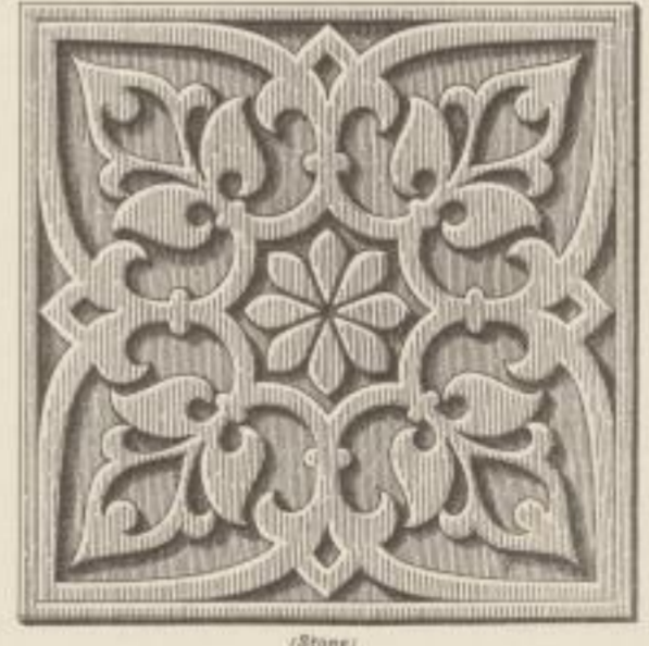
FIG. 3. FROM THE MASJID OF FIRUZ SHAH AT DELHI.