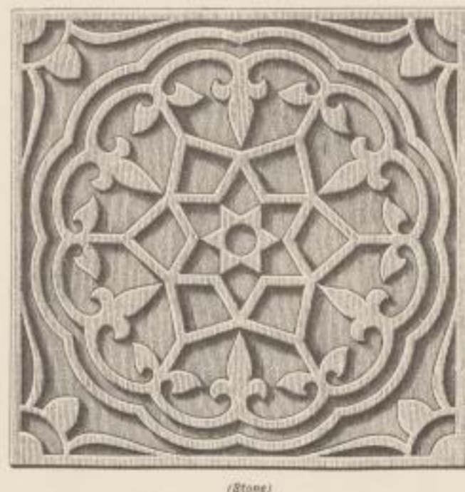
FIG. 4. FROM THE MASJID OF FIRUZ SHAH AT DELHI.