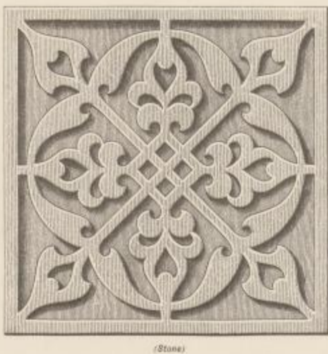
FIG. 2. FROM THE MASJID OF FIRUZ SHAH AT DELHI.