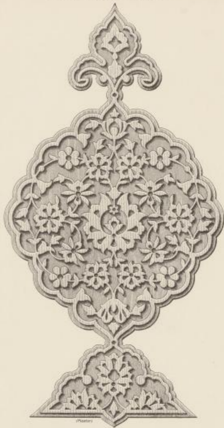
FIG. 3. FROM THE TOMB OF BATASA WALA, DELHI.