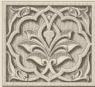
FIG. 2. FROM A BUILDING AT PATHPUR DEHLI.