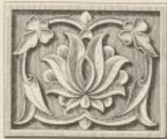
FIG. 4. FROM A BUILDING AT PATHPUR DEHLI.