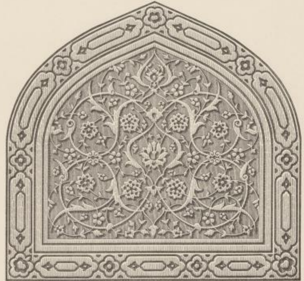
Plaster Ornaments in Wall Sections.