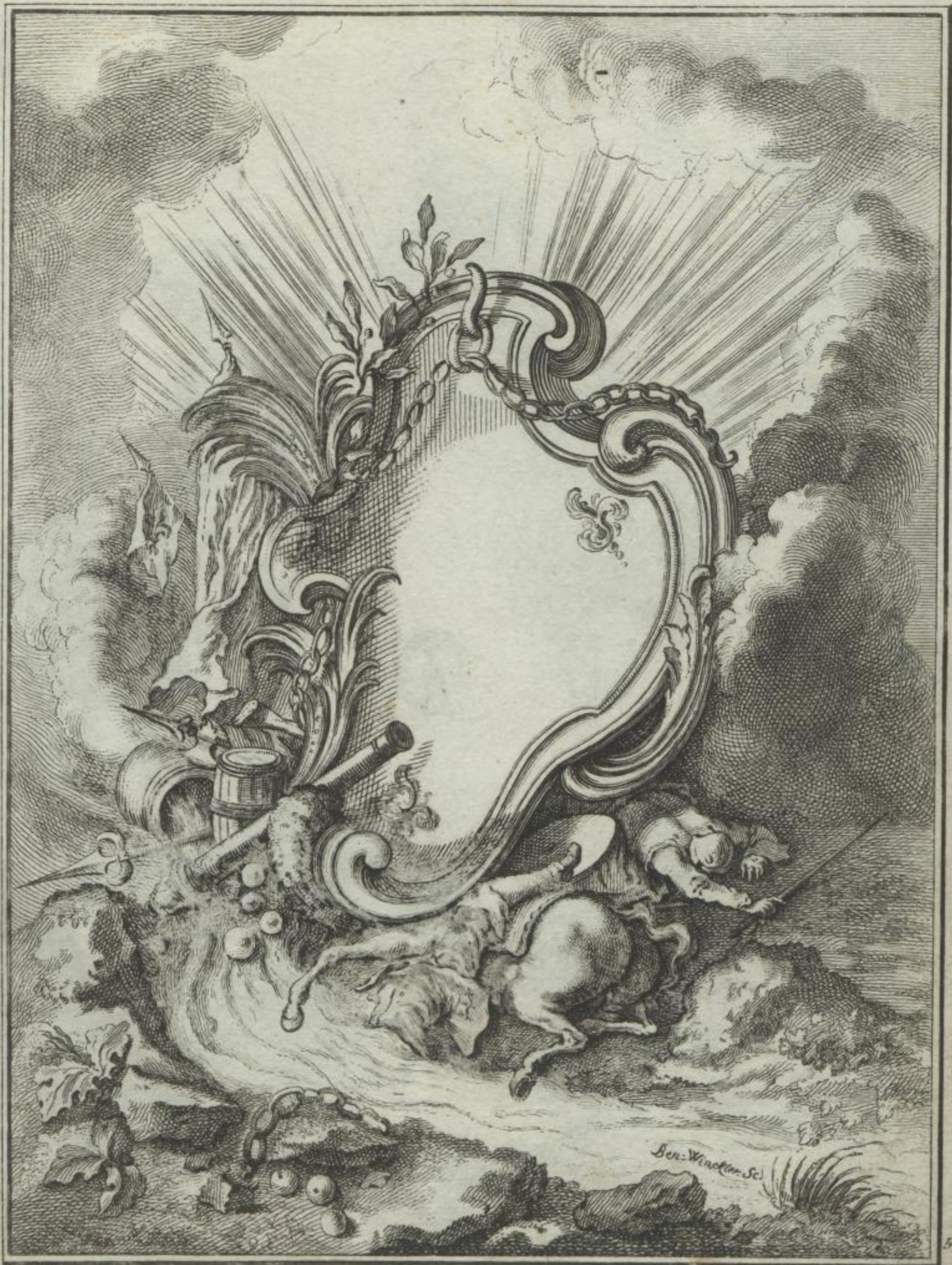
de la Loue, mv.