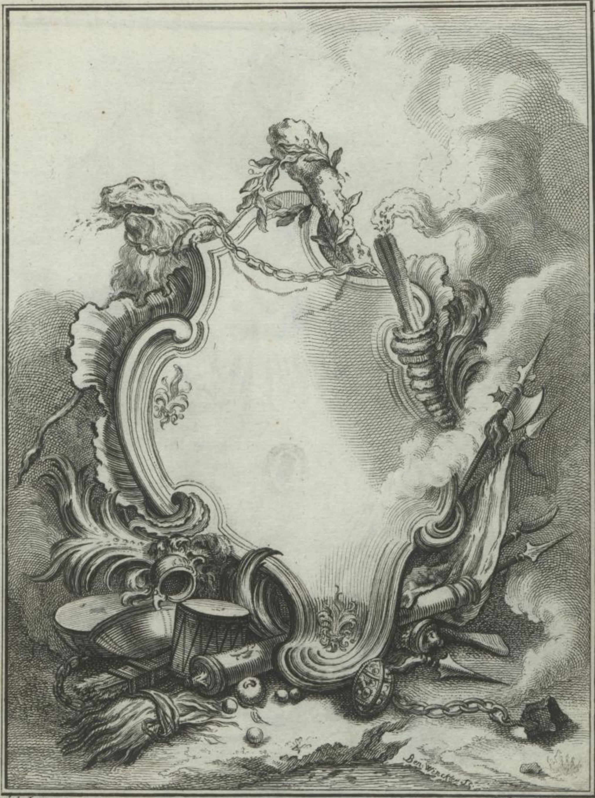
de la Loue, av.