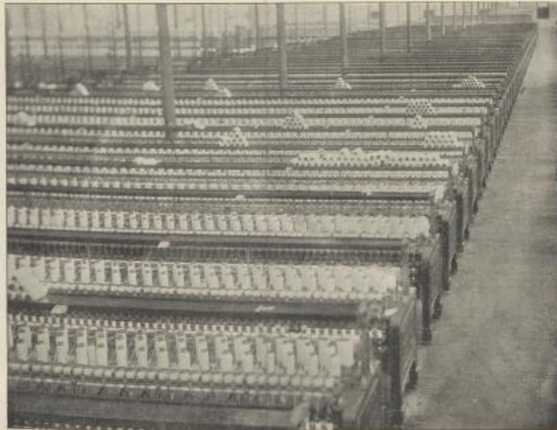
Fig. 4. Ringspinnmaschinen-Saal.