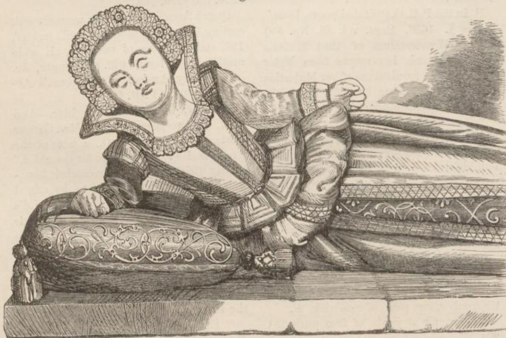
Monument of the Princess Mary, third daughter of James I. + 1607. Westminster Abbey.