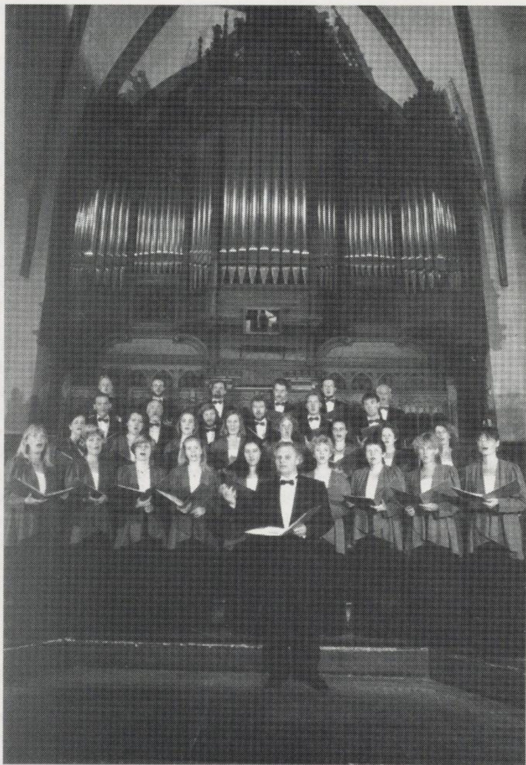
The Leipzig Synagogal Choir, Thomas Church, Leipzig

sponsored by the German Foreign Office and the German Music Council, Dresdner Bank AG Leipzig