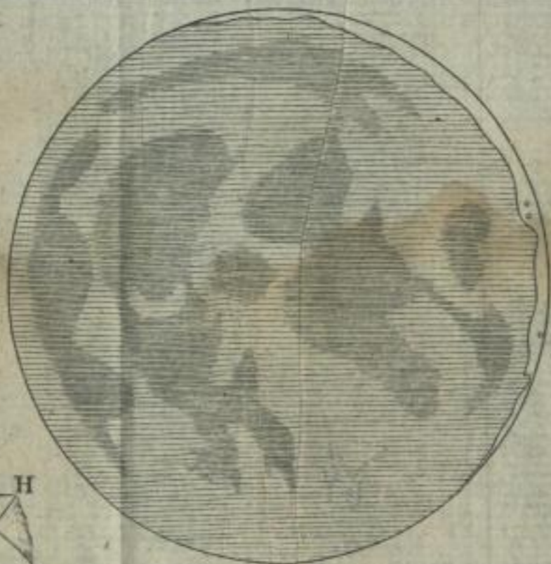
Fig. 6. Page 124.