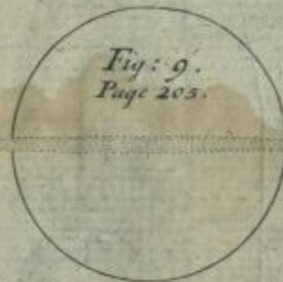
Fig. 9. Page 205.