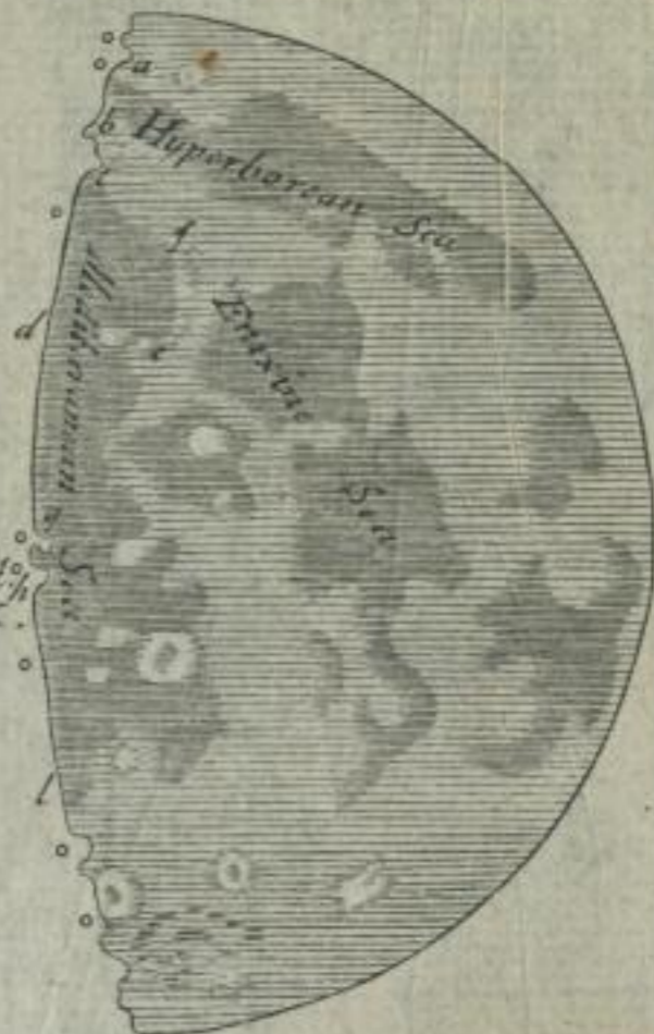
Fig. 11. Vorbericht pag. CXXX.