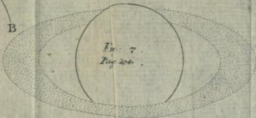
Fig. 7. Page 204.