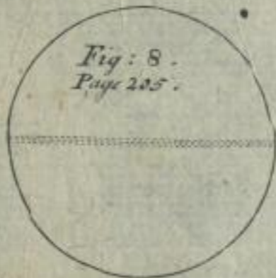
Fig. 8. Page 205.