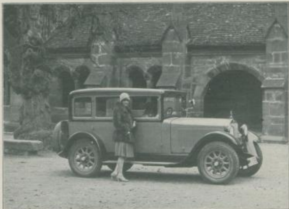
8/38 PS 6 Cyl. Mercedes-Benz Innenkreuz-Limousine