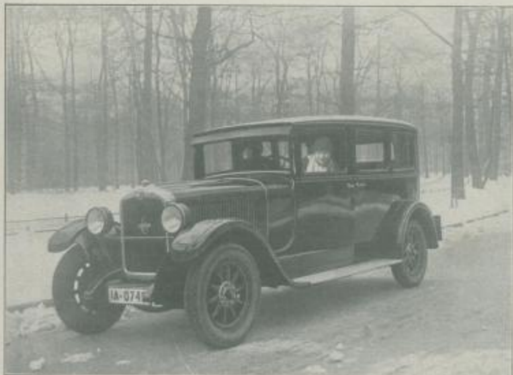
12/55 PS 6 Cyl. Daimler Innenkreuz-Limousine