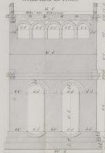
Fig. 2 Section durch die Pfeiler