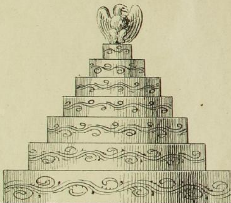
N o 2.