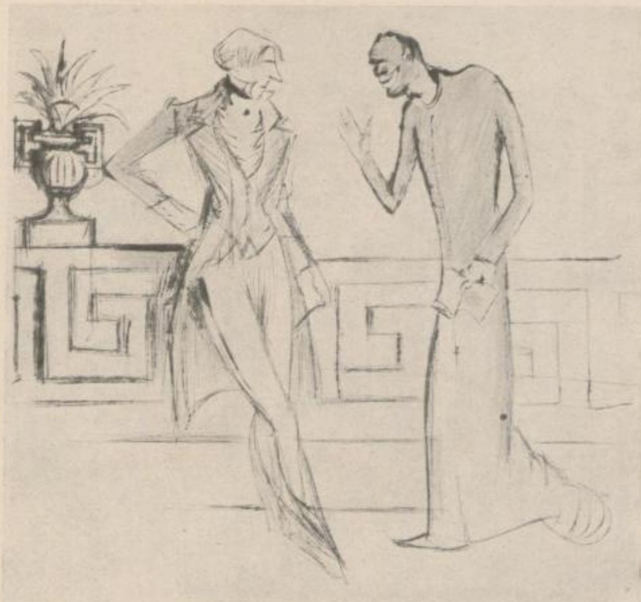
ILL. ZU GRABBE'S „SCHERZ, SATIRE, IRONIE“ / DREI MASKEN VERLAG, MÜNCHEN