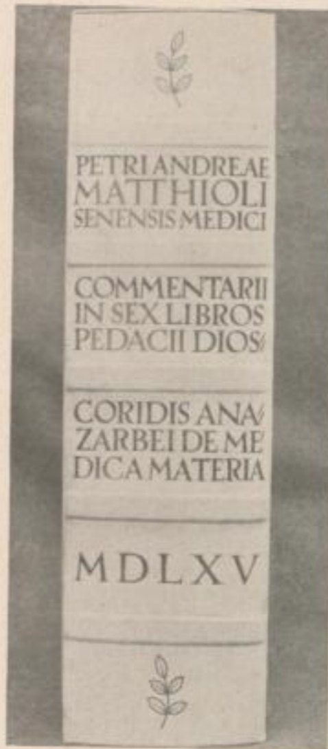
BUCHRÜCKEN