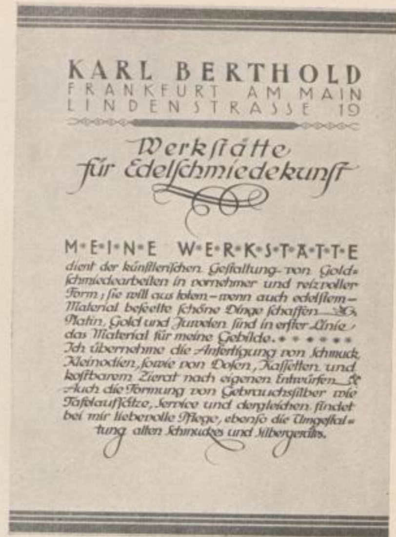
PROSPEKT / A. WINDISCH