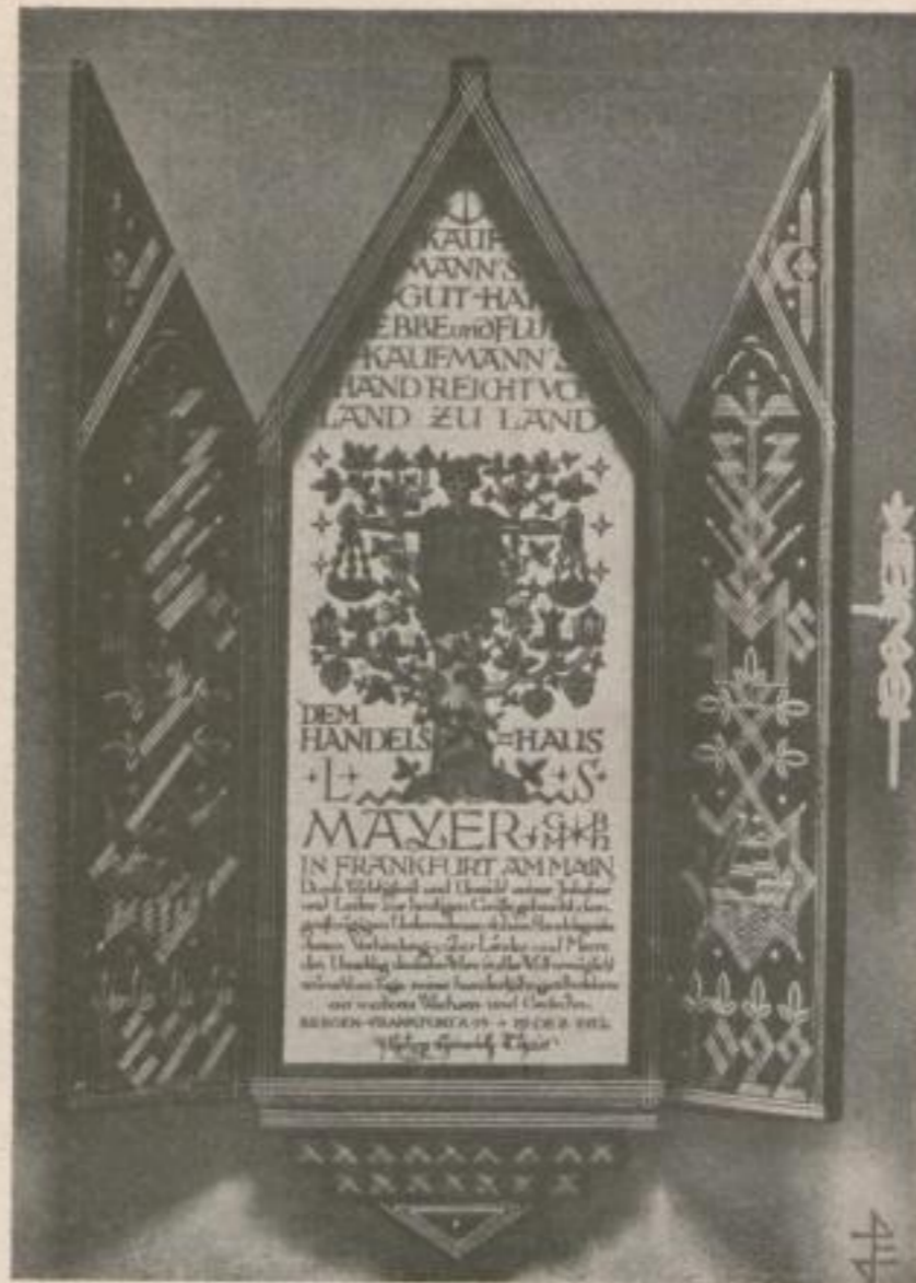
ADRESSE / LUDWIG ENDERS