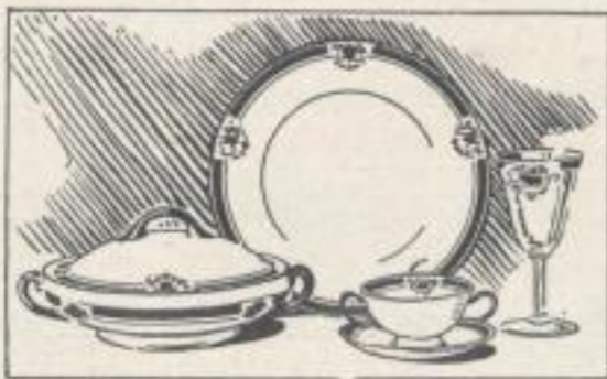
A set of the Westchester pattern of the beautiful Lenox china. On its famous cream glaze is a decoration of a wide blue band, broken by medallions of fruit and flowers in natural colors. For 103 pieces, $625.00; for 55 pieces, $365.00. It is possible to get a crystal set designed to match this china.

FROM caviar to cafe noir, every pleasure of the table needs some fine piece of china to enshrine it, some crown of crystal to hold it. And the hostess who takes care that every course of her dinner shall spread the fame of her cook, should take care that her china ranges up with her dinner.