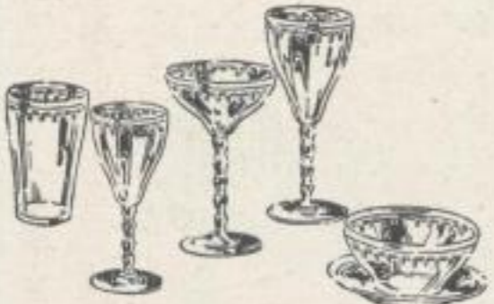
A crystal set that will grace the table and delight the hostess. It is from Czechoslovakia, and has an engraved design about the rim, while the bowl is of optic effect. The stems are bamboo style. For six dozen pieces, $126.00. The pieces may be bought separately in dozens or half-dozen.