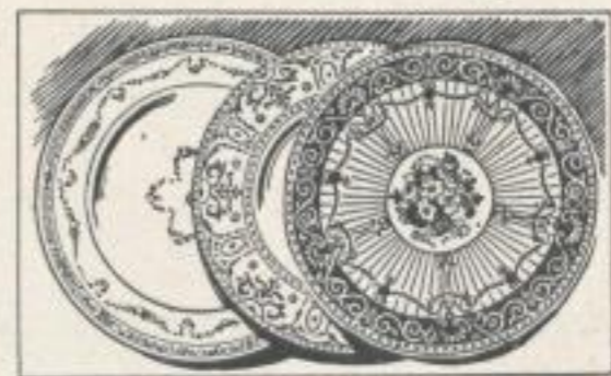
Whether formal or informal, any dinner worthy of the name, in the social sense of the word, should have place plates as its starting point. We have them in a myriad of beautiful designs, gay and colorful, or more dignified, from all the famous potters. From $25.00 to $750.00 a dozen.