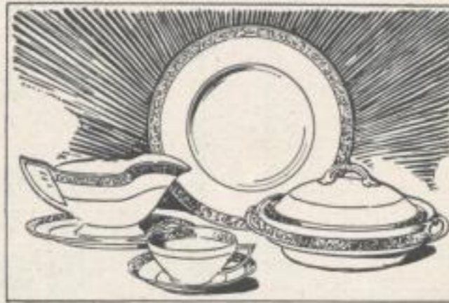
A dinner set from a famous potter that any hostess would be happy to own. This is of the beautiful Minton china, decorated with a formal engraved gold border and ivory colored rim on its white background. For 103 pieces, the price is $635.00; for 55 pieces, $365.00.

The charm of Wedgwood goes on undiminished, immune to whatever may be new. This set is of the Tremham pattern, with Queen Anne shapes in ivory color done with raised ribbed border and checker band of red and yellow. The center is decorated with a flower urn in yellow, rose, orchid, green and black. For 103 pieces, $135.00; for 55 pieces, $85.00.