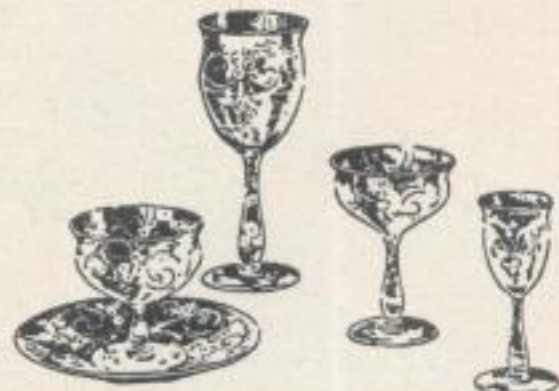
There can be nothing finer in glassware than this set of English rock crystal, with wide iraglio border and a conventional engraved and polished design with sprays of daisies and frosted medallions. For five dozen pieces, as shown, $770.00. Each size may be had separately in dozens or half-dozen.

A charming set of English Trianon ware of ivory tone, with hand-painted brocade pattern in blue, plum, yellow and rose, between narrow black lines. It will be found an attractive service for almost any occasion, and a set the particular hostess will delight in having in her china cupboard. For 103 pieces, $90.00; for 55 pieces, $55.00.