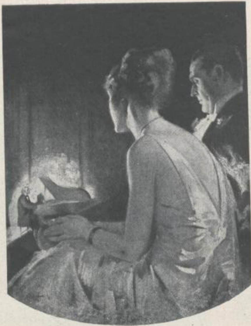
SUNDBLUM (Campbell-Ewald Co.)