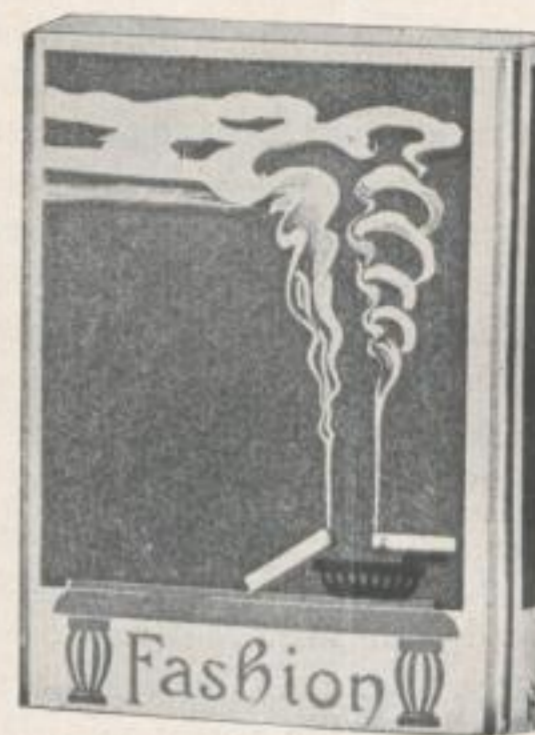
ZIGARETTENPACKUNG CIGARETTE WRAPPING

of the costliness of the material employed: silver cloth, velvet, brocade; covers, ornaments and clasps made of noble metals, plates of hammered copper or brass or enamel.