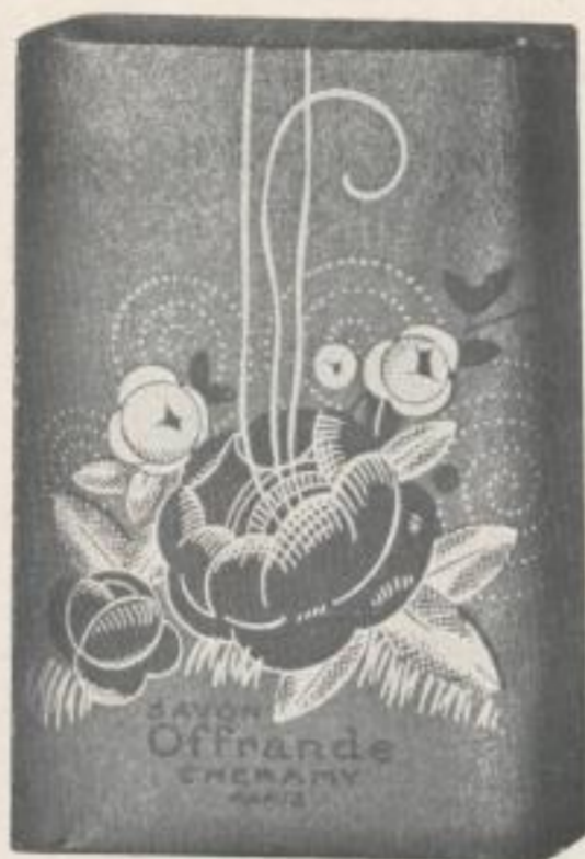
SEIFENPACKUNG SOAP WRAPPING