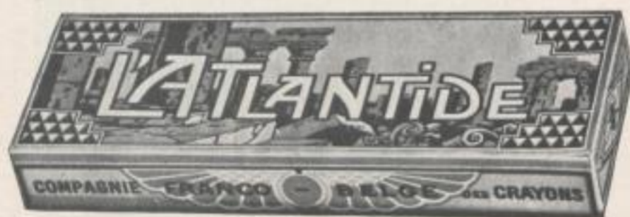
BLEISTIFTPACKUNG / PENCIL BOX