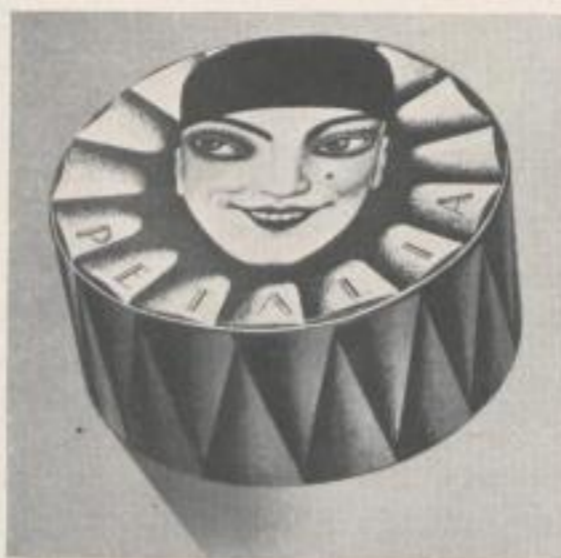
PUDERBÜCHSE POWDER BOX