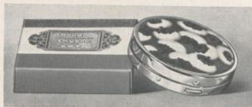
PUDERBÜCHSE / POWDER BOX