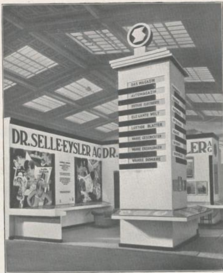
Dr. Selle-Eysler A. G., Berlin