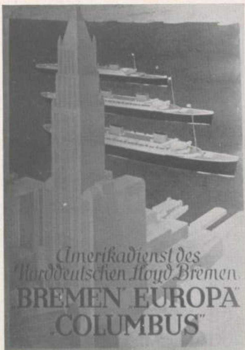
5. Preis HANNS WAGULA Graz / Oesterreich