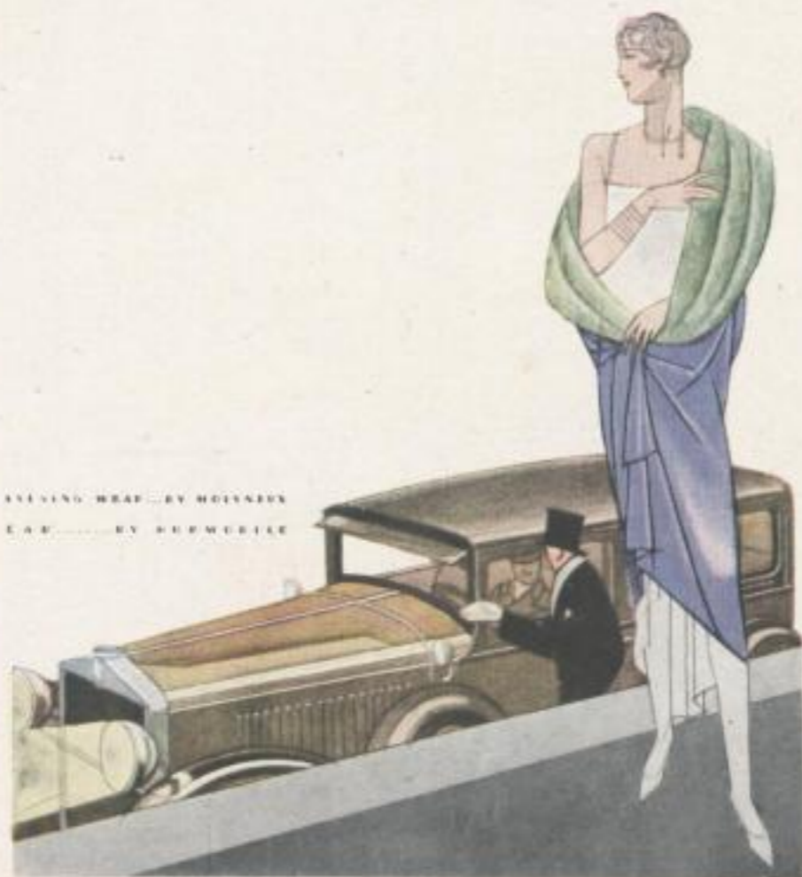
Evening wrap... BY HUGOBOSCH Car... BY HUPMOBILE