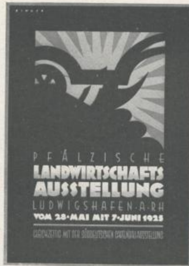
Drei Industrie-Plakate Three Posters for Industry