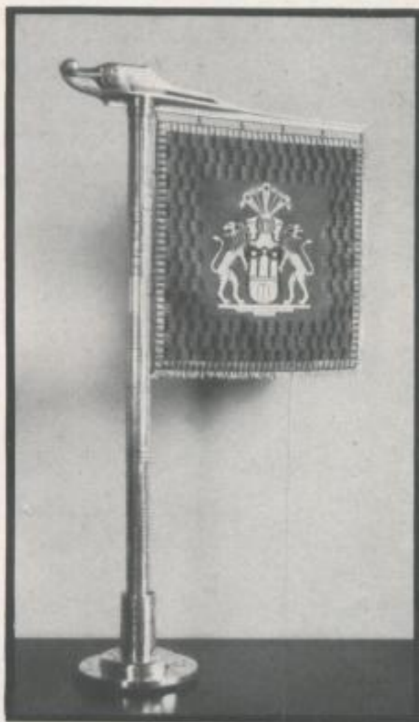
Club Table banner

Karberg is an artist of tectonics rather than of pictured phantasy, one who builds up shapes rather than an inventive draughtsman. His diplomas, for instance, are almost devoid of ornament. They are effective rather by means of the austere building up of the design and the craftsmanlike way in which the ma-