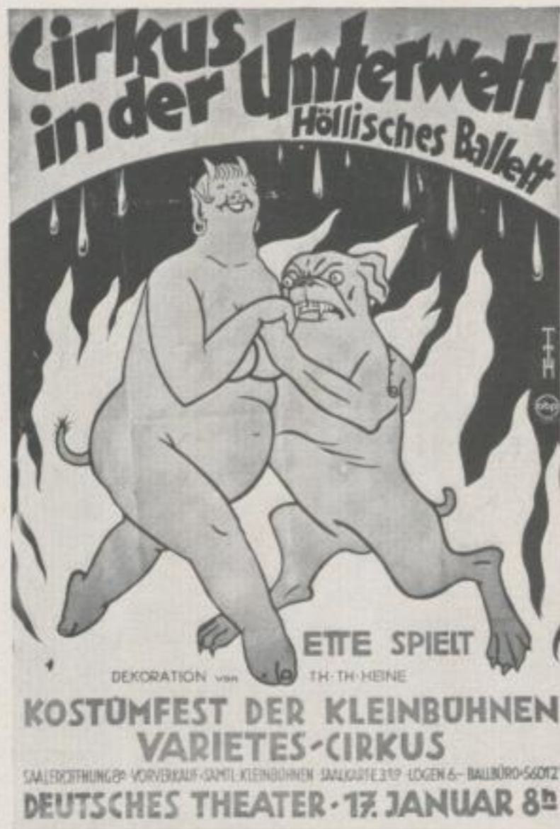
TH. TH. HEINE