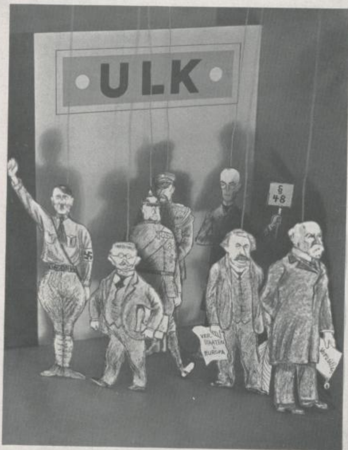
Freitag-Beilage des Berliner Tageblatt