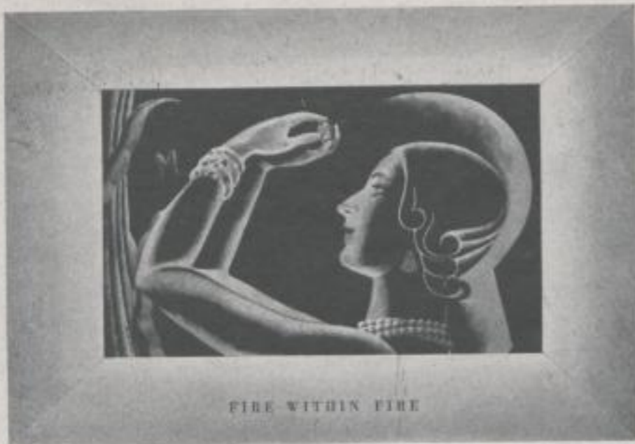
FIRE WITHIN FIRE

The BLACK OPAL... it seems an exquisite blending of all the rarest jewels... the glowing swirls of pearls, the lighted points of sapphires, the green depths of emeralds, the opal's wondrous crested flame. And each has captured that elusive beauty equaled only in swift clouds at evening... in fire, from distant horizons near the sea... in the dimmed wings of great Brazilian butterflies. • It is a point of pride with Marcus & Company that this house should have exhibited the first collection of these incomparable stones that the world has ever seen... a collection which, in the judgment of jewel connoisseurs, stands second to none, even today. • It was possible that the black opal should have immediately found favor at the hand of fashion, and occasioned an altogether new and notable mode in jewelry. For where could a stone so charming find a better counterpart than in the beauty of those women who were always to be the cynosure of eyes in the great world of manners? • Black opals, mounted or unmounted, from $6750 to $25,000.