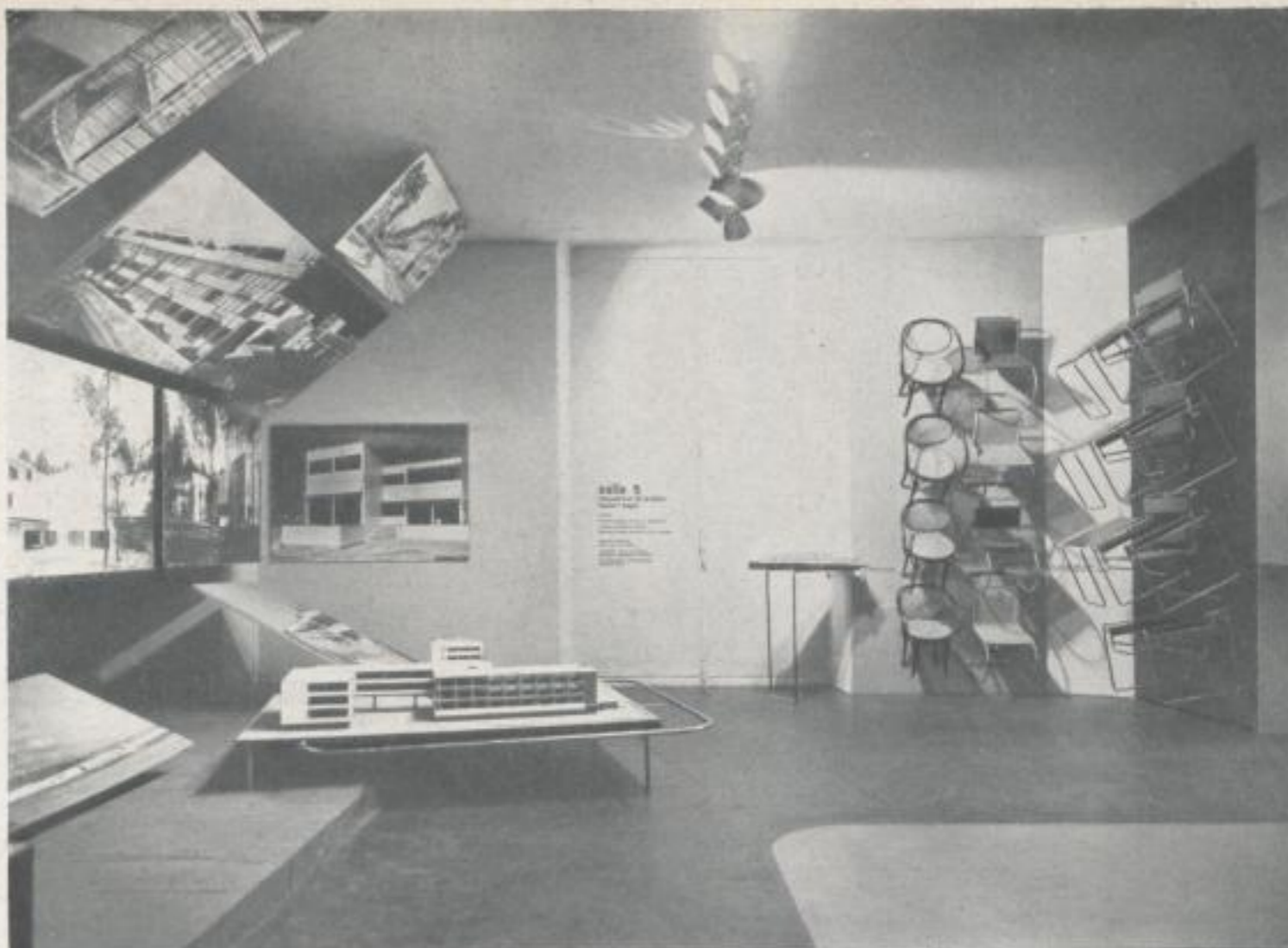
Ausstellungsstand in der Deutschen Kunstgewerbeausstellung in Paris

The catalogue and a great deal of the arrangement of the exhibits for the German Exhibition of Arts and Crafts in Paris, which attracted so much attention, were the work of Herbert Bayer. The space and the exhibits were so cleverly composed that an effect of completeness, of an interesting organic whole was always achieved, without detracting in any way from the individuality of each object exhibited.