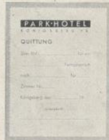
Business Printed matter used by a modern Hotel