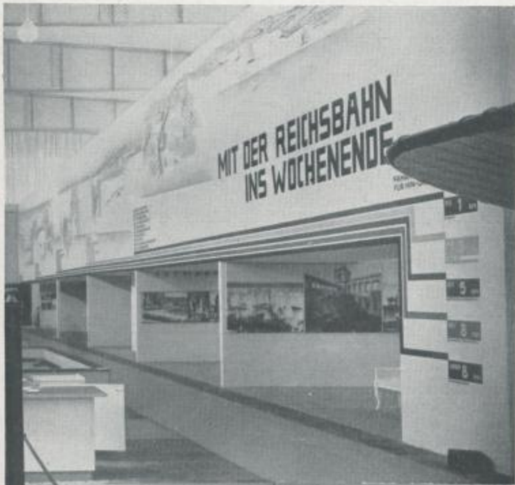
Abteilung Brandenburg Brandenburg Section