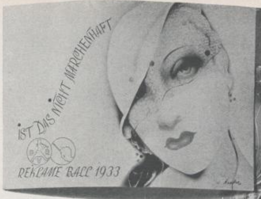
Titelblatt Title Page