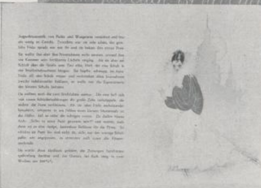
Illustration ILSE WENDE- LUNGERSHAUSEN