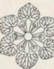
葵 持 子 葉 六