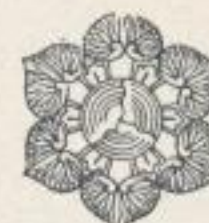
葵 葉 六