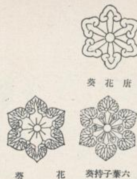
葵 花 唐