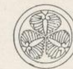
葵 津 會