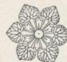
葵 花 劍