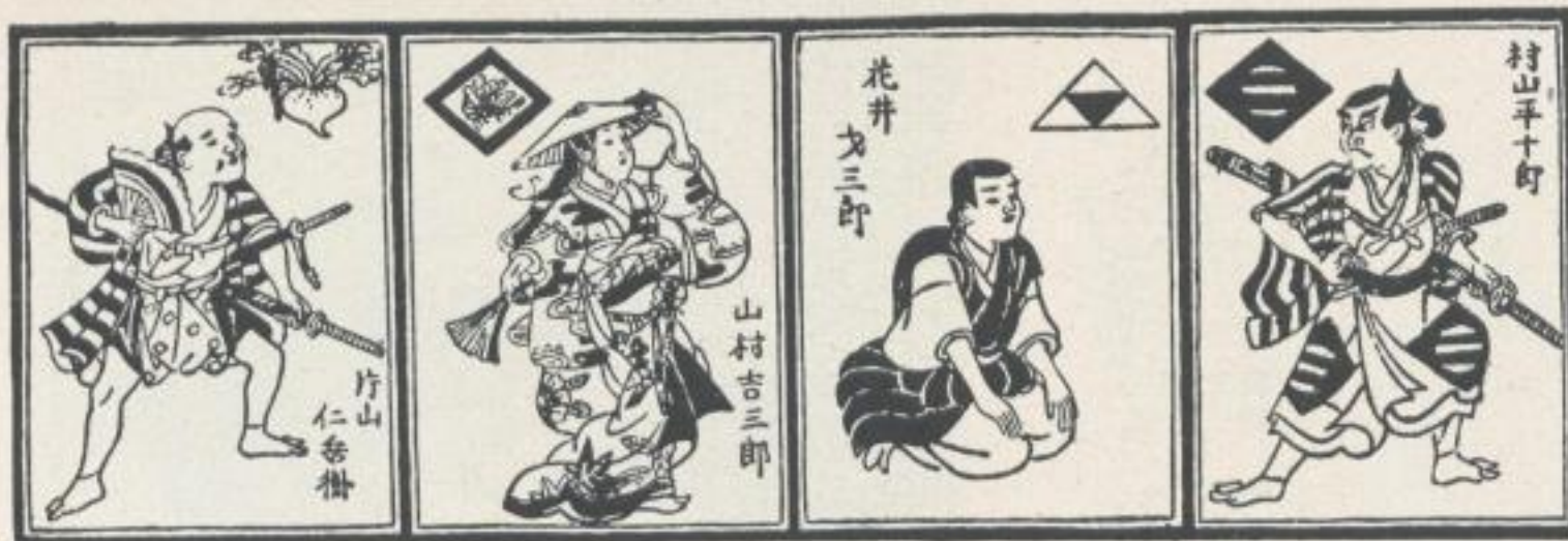
Crests of actors