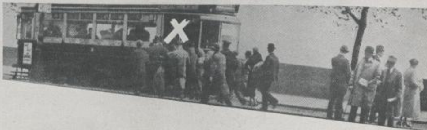
Four out of every six of these people go home rightly to radio with perfect with Mallard Values. Three million aerials in this country lead down to Mallard Master Values. And three million aerials can't be wrong.