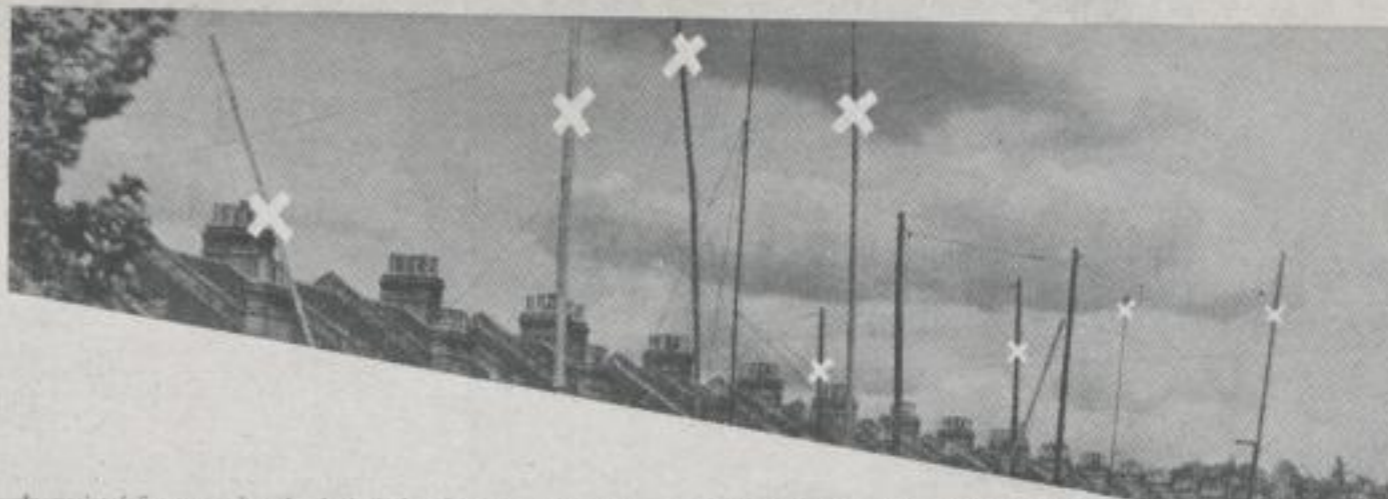
As master plan, sited out a hundred miles from London. Aerial - all or none, or neither - all standing (or leaning) for Entertainment. If not, more, allured Master Values. And three million aerials can't be wrong.

Entwurf Design PHILIP ZEC and HOWARD BARNES