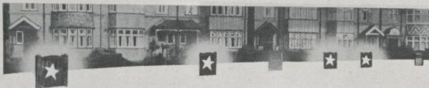
Four out of six of these homes are Mallard values. 3 million