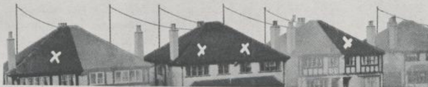
Four out of six of these homes are Mallard values. 3 million aerials in this country lead down to Mallard Master Values. And 3 million aerials can't be wrong.

Inseratenserie für illustrierte Tageszeitungen Advertising Series for Illustrated Daily Papers