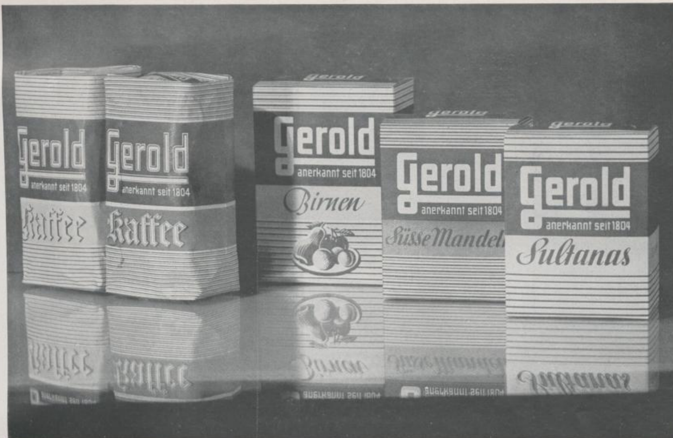
Ausstattung für Kolonialwaren Wrappings for Colonial Goods