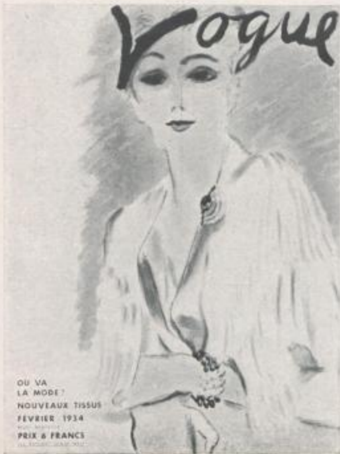
Illustrations from the "Vogue"