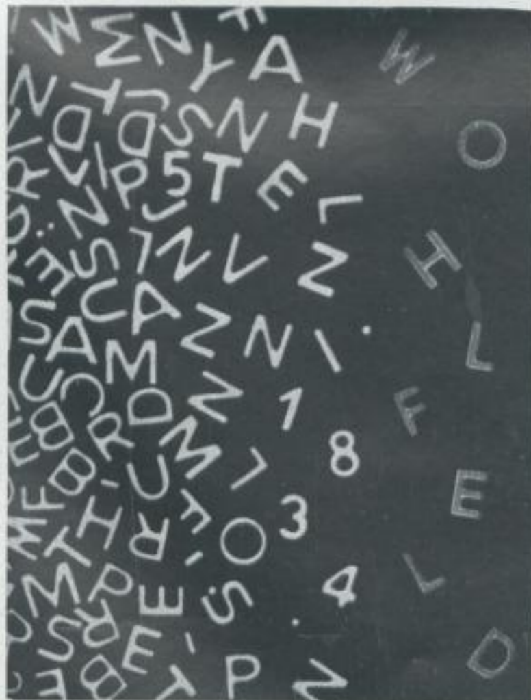
Prospekt der Druckerei A. Wohlfeld Folder of the Printing House A. Wohlfeld