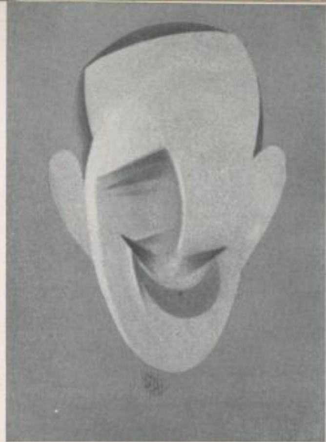
EX-KÖNIG VON SPANIEN THE EX-KING OF SPAIN