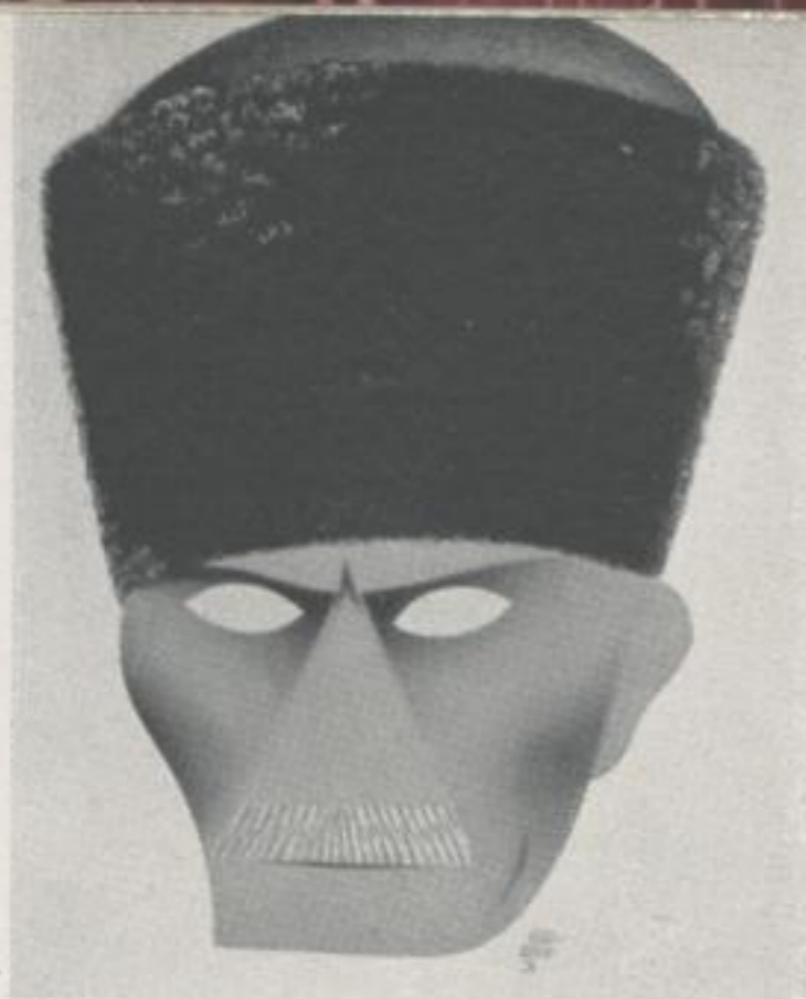
MUSTAPHA KEMAL PASCHA