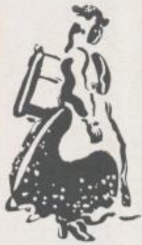
LESTER BEALL The Chicago Tribune