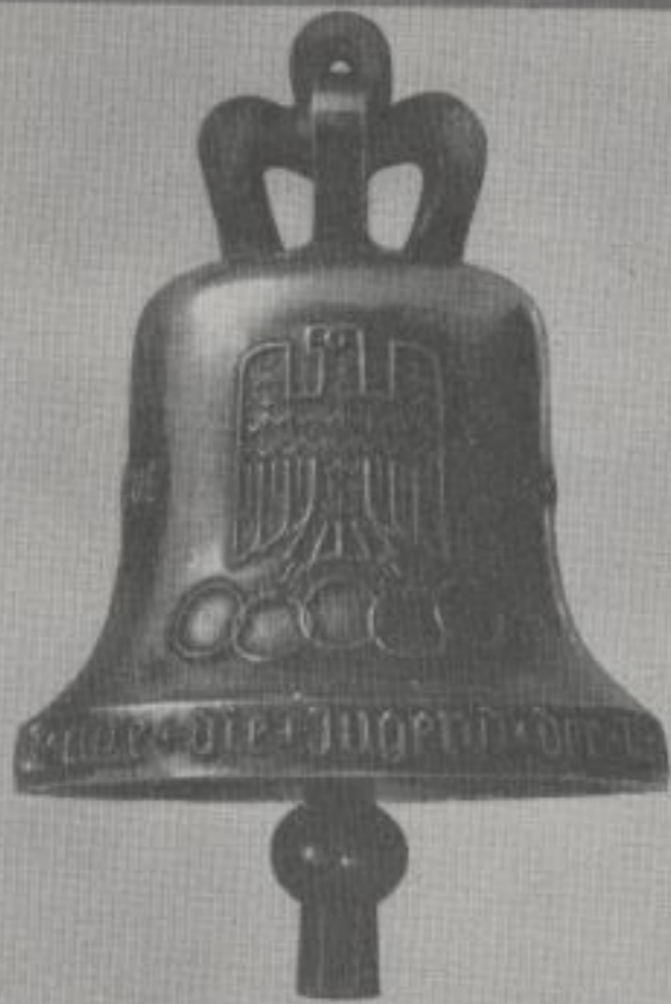
Olympiaglocke, modelliert von dem Bildhauer Lemcke