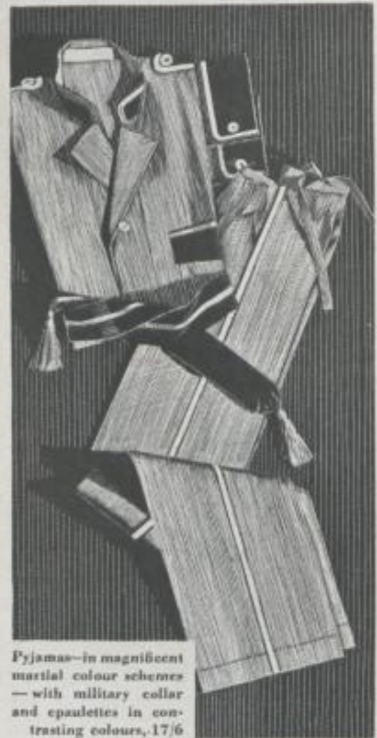
Pyjamas—in magnificent martial colour schemes — with military collar and epaulettes in contrasting colours, 17/6