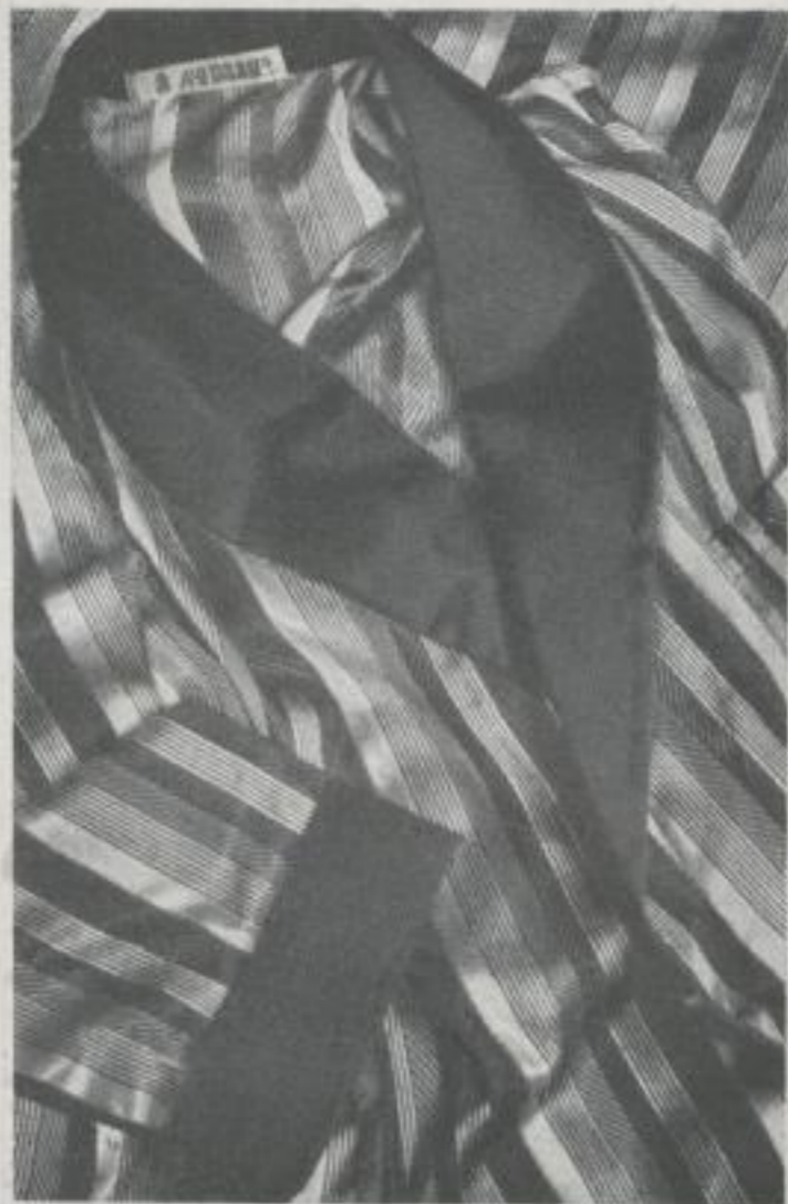
A very wide choice of dressing gowns of every kind, 21/- to 5 guineas.