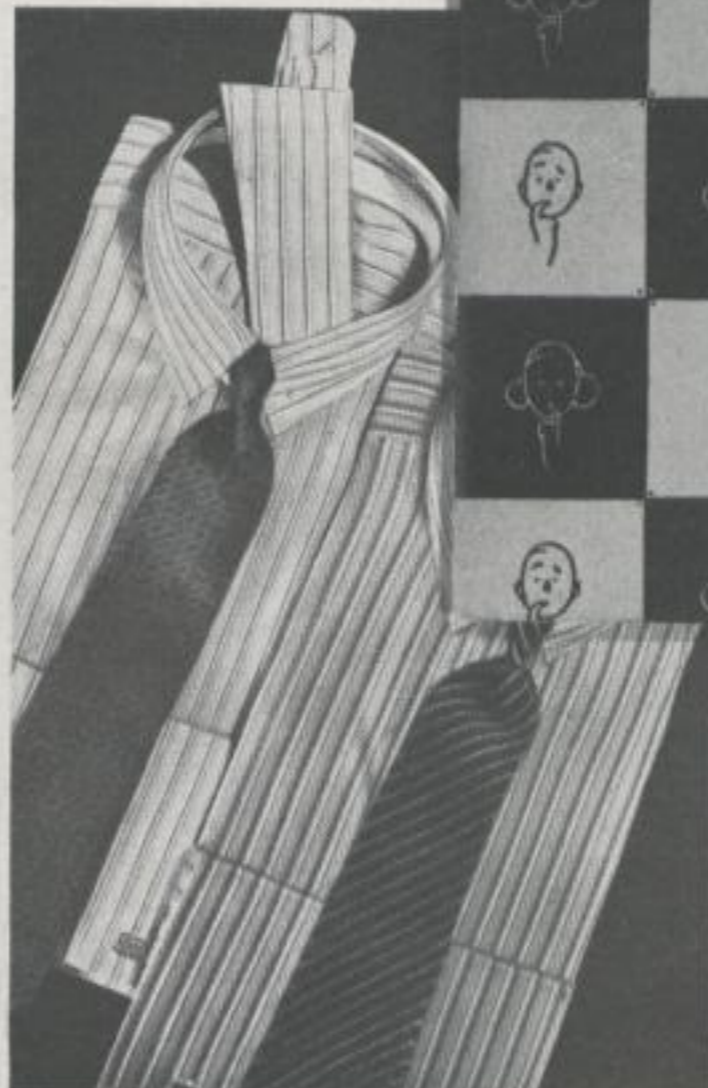
Summit woven lustre shirts, with two reinforced soft collars to match, 10/6, 12/6, 15/6.