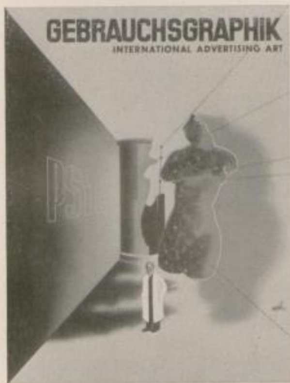
Umschlagentwurf für die „Gebrauchsgraphik“ Coverdesign for the periodical „Gebrauchsgraphik“