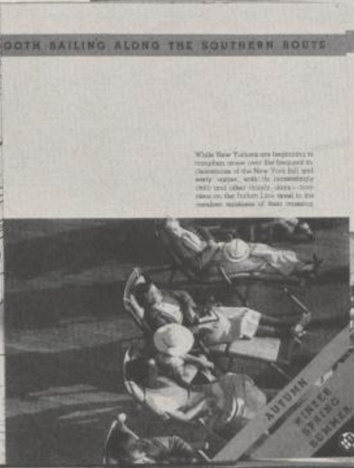
Folder of Shipping Lines