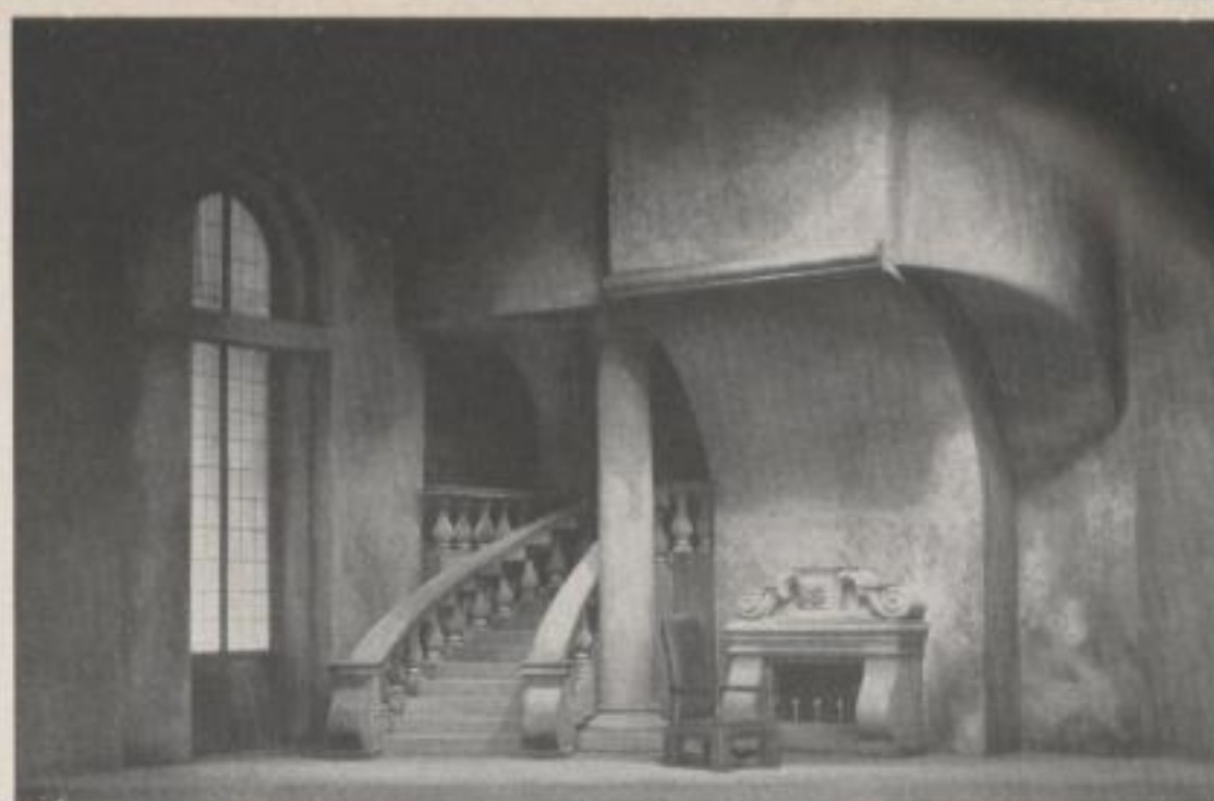
Verdi „Die Räuber“ II. Akt