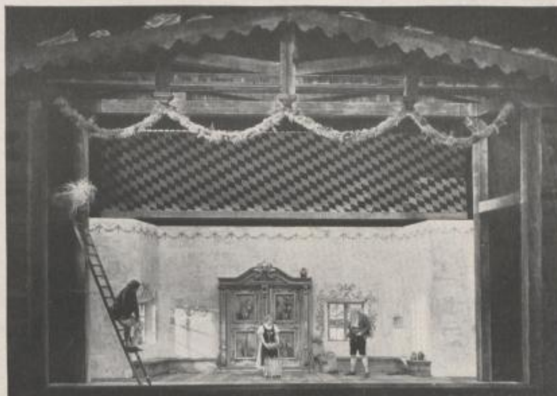
Egk „Die Zaubergeige“ I. Akt