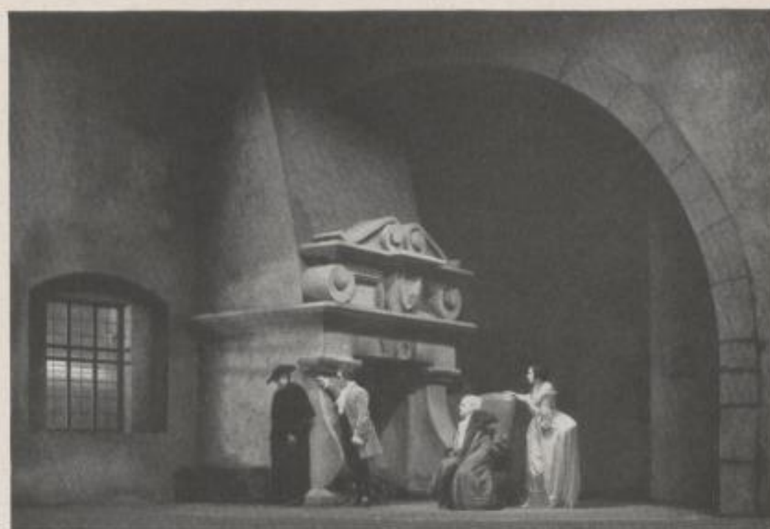
Verdi „Die Räuber“ III. Akt