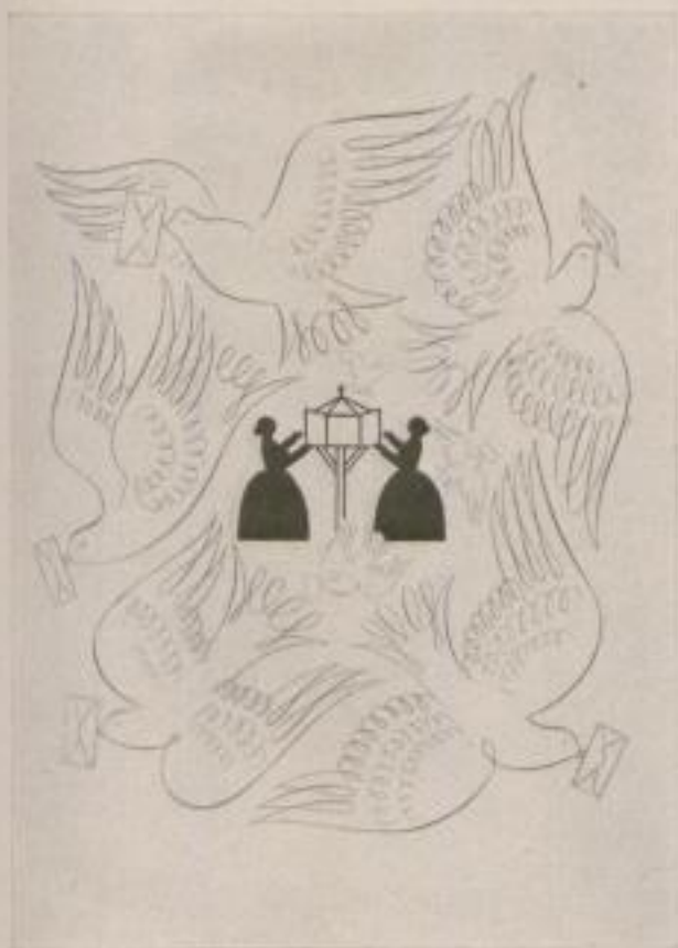
Neujahrsglückwunsch New-Year's card